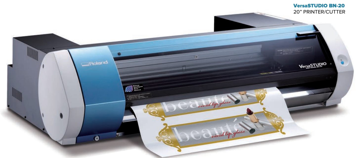
VersaSTUDIO BN-20 20" PRINTER/CUTTER